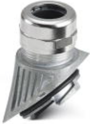
EVO EMC cable gland with bayonet locking, B series, size M32, cable diameter: 14 - 21 mm

Please be informed that the data shown in this PDF Document is generated from our Online Catalog. Please find the complete data in the user's documentation. Our General Terms of Use for Downloads are valid ( http://phoenixcontact.com/download )