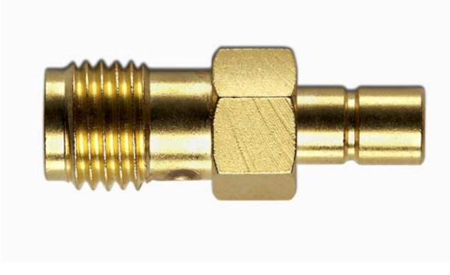
Model 72978 SMA (F) TO SMB (M)