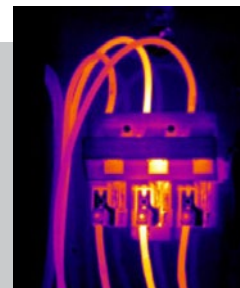
Three-phase Full Infrared