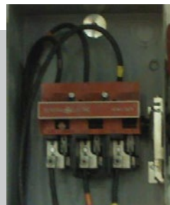
Three-phase Full Visible

Precisely blended visual and infrared images with crucial details to assist in identifying potential problems.