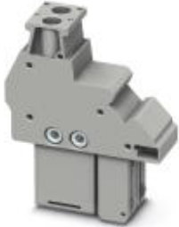
Plug, 2-pos. with integrated, automatic short circuit function

Please be informed that the data shown in this PDF Document is generated from our Online Catalog. Please find the complete data in the user's documentation. Our General Terms of Use for Downloads are valid ( http://download.phoenixcontact.com )