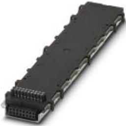
DIN rail connector for installation component housing BC...

Please be informed that the data shown in this PDF Document is generated from our Online Catalog. Please find the complete data in the user's documentation. Our General Terms of Use for Downloads are valid ( http://phoenixcontact.com/download )