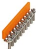
Fixed bridge, Number of positions: 10, Color: silver

Please be informed that the data shown in this PDF Document is generated from our Online Catalog. Please find the complete data in the user's documentation. Our General Terms of Use for Downloads are valid ( http://download.phoenixcontact.com )