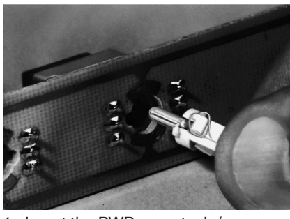
Insert the PWB receptacle/ incandescent lamp assembly through a hole in the printed wiring board.