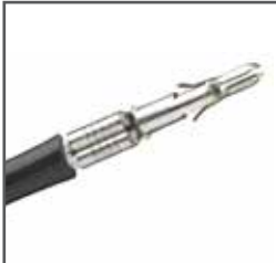
Split Pin Male Crimp Terminal