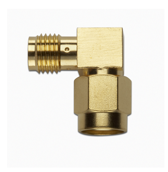
Model 72965 SMA R/A PLUG TO JACK